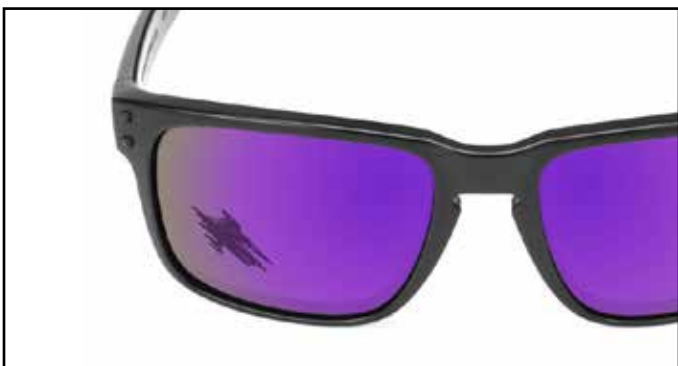
PHOTO 1 - DAMAGED AREA - FULL VIEW