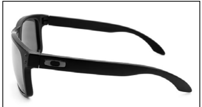
PHOTO 3 - LEFT SIDE PROFILE