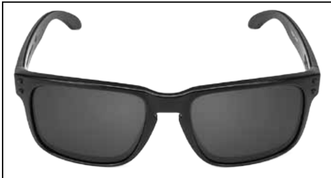
PHOTO 2 - FRONT VIEW