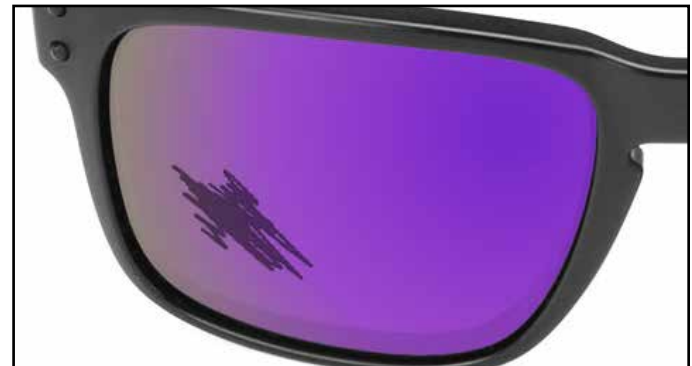
PHOTO 2 - DAMAGED AREA - CLOSE UP